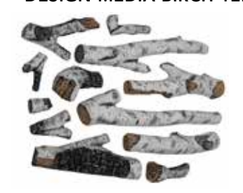
For XT & XT Bespoke models only

The NEW Design Media Birch 12 piece log set expands the Design Media Birch 15 piece log set, if required, and is available for purchase.